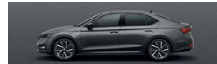
Graphite grey metallic