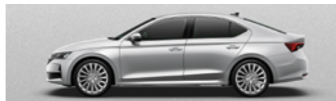
Brilliant silver metallic