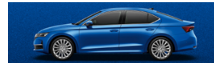
Race blue metallic (*)