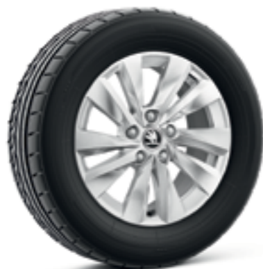
16" Matar Aero silver alloy wheels