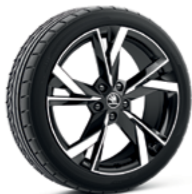
19" Draconis black metallic alloy wheels, brushed