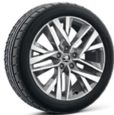
18" Lerna anthracite metallic alloy wheels, brushed