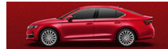
Velvet red metallic (*)