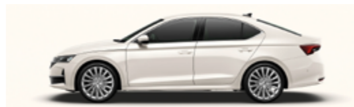
Candy white uni (**)