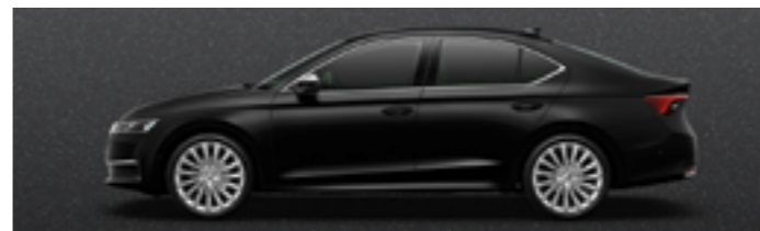
Magic black metallic