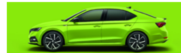
Mamba Green uni (*)