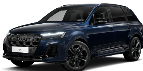
Waitomo Blue Metallic