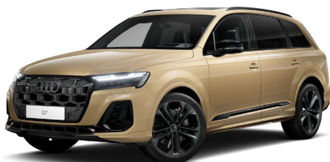
Sakhir Gold Metallic