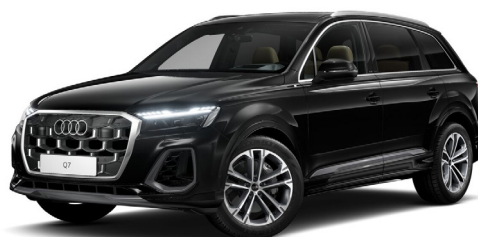
Myth Black Metallic