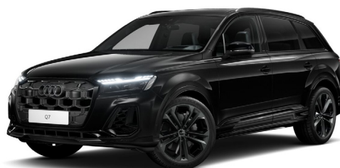
Myth Black Metallic