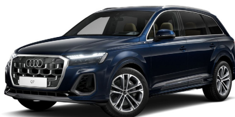
Waitomo Blue Metallic