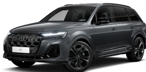
Daytona Gray Pearllescent