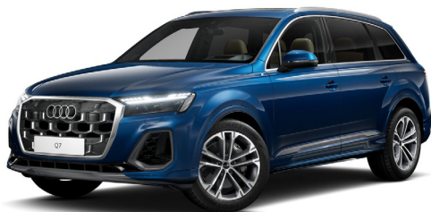
Ascari Blue Metallic