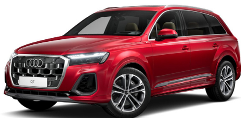
Chili Red Metallic