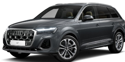
Daytona Gray Pearllescent