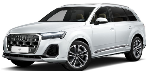
Glacier White Metallic