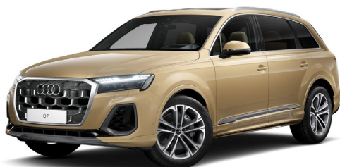
Sakhir Gold Metallic