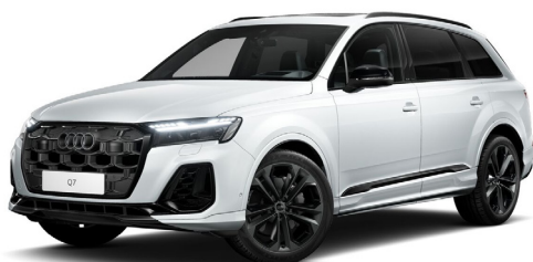
Glacier White Metallic