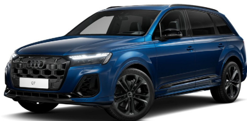
Ascari Blue Metallic