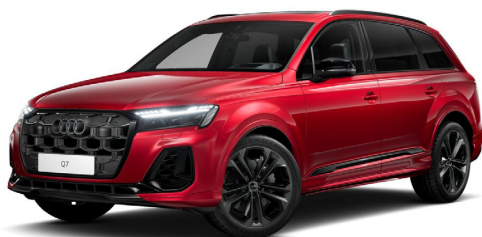
Chili Red Metallic