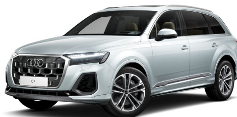
Satellite Silver Metallic