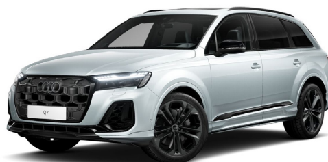
Satellite Silver Metallic